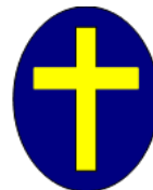
The Batt C.E. School